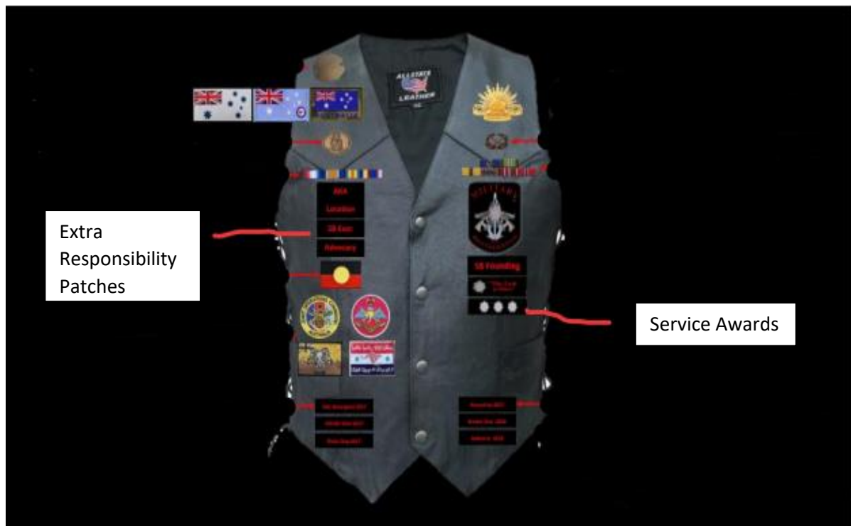
Figure 1 – Position of Awards and other Responsibility Patches.