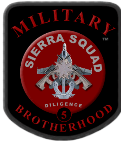
Figure 4 – Sierra Squad Diligence Patch.