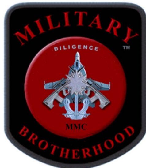
Figure 5 – Service Member Diligence Patch.