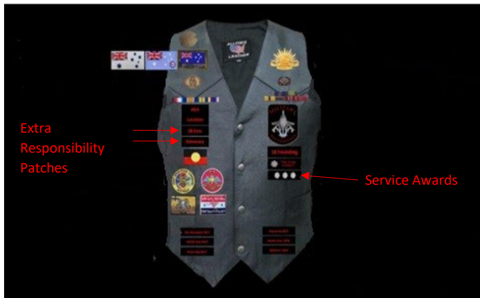
Figure 1 – Position of Awards and other Responsibility Patches.