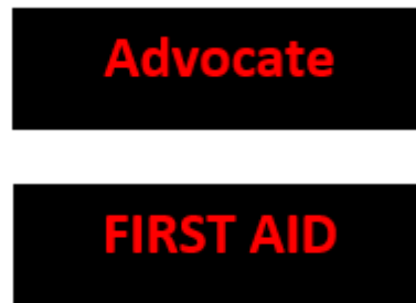
Figure 3 – Extra Responsibilities Patches